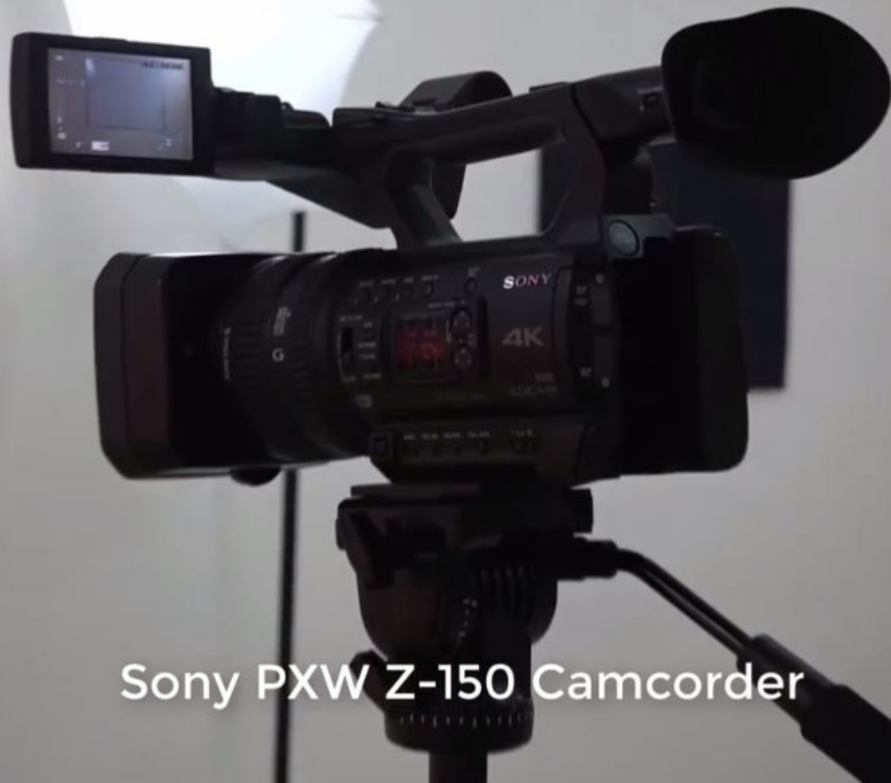
Sony PXW Z-150 Camcorder